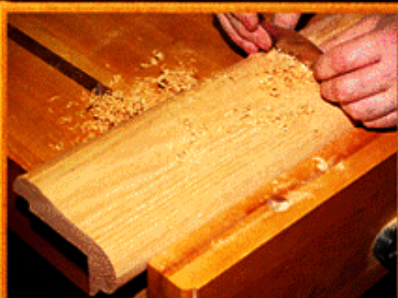
9 Tips for Making Complex Moldings