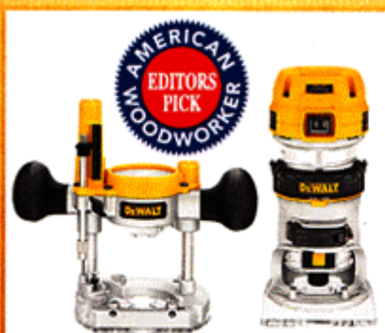
New Compact Router