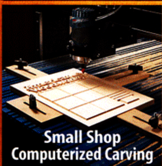
Small Shop Computerized Carving