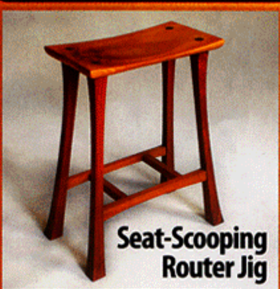
Seat-Scooping Router Jig