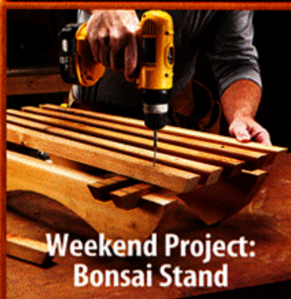
Weekend Project: Bonsai Stand