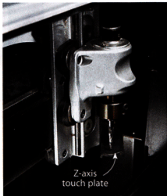
Z-axis touch plate

The CarveWright spindle consists of a carriage with bearings that run on parallel round guides. The router bit is held in a chuck that is driven by a flexible shaft. Changing the router bit simply requires loosening an allen screw. The chuck accepts steel-shank bits from 1/8"-1/2" diameter. The Z-axis touch plate automatically measures the projection of the bit to ensure correct cutting depth.